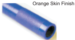
Orange Skin Finish