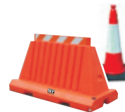
Road Safety Equipments