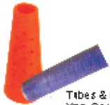
Tubes & Cones for Yarn Conditioning