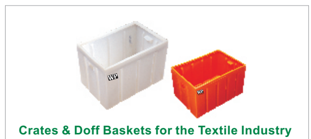
Crates & Doff Baskets for the Textile Industry

Tel : 044 - 4264 4241 M : 98422 56186 (Board) Email : chennai@whiteplast.com