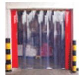
PVC Strip Curtain